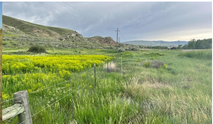
Leafy spurge has taken over the private land on the left of the fence, while grass thrives on the public right of way on the right side of the fence.