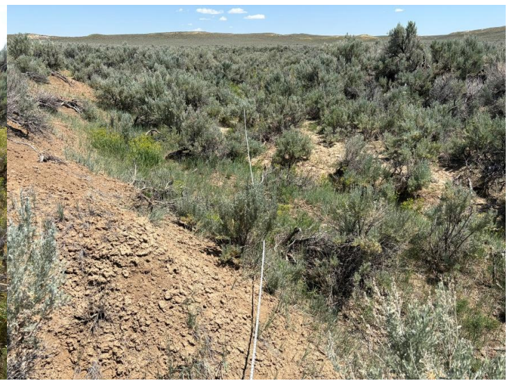
2025 - Leafy Spurge