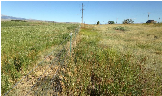
Russian knapweed has taken over the private land on the left of the fence, while grass thrives on the public right of way on the right side of the fence.

The Weed and Pest District controls noxious weeds along county roads using the mil levy from local tax collection, with no additional costs passed on to the county road and bridge dept. A $45,000 - $65,000/year investment in stopping noxious weeds from spreading up and down roads as well as protecting adjacent landowners' interests.