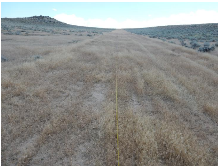
2018 - Cheatgrass